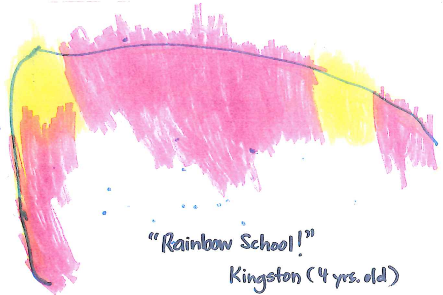
"Rainbow School!" Kingston (4 yrs. old)